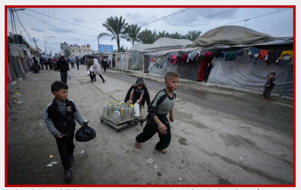
Palestinian children move a cart carrying plastic bottles of water at a camp for displaced people in Deir al-Balah, Gaza Strip.

When it comes to investing in defence companies, Aviva is by far the largest investor with $880 million invested across 12 defence contractors. Allianz comes second with $452 million invested across 15 complicit defence companies. Allianz is the only one still investing in Elbit Systems. Our analysis of insurers' investments over the whole of 2024 reveals that three out of five examined insurers kept increasing their investments in companies supplying military equipment to Israel throughout the year, giving no consideration to the unfolding genocide and making bigger financial gains driven by the mass murder of innocent civilians.