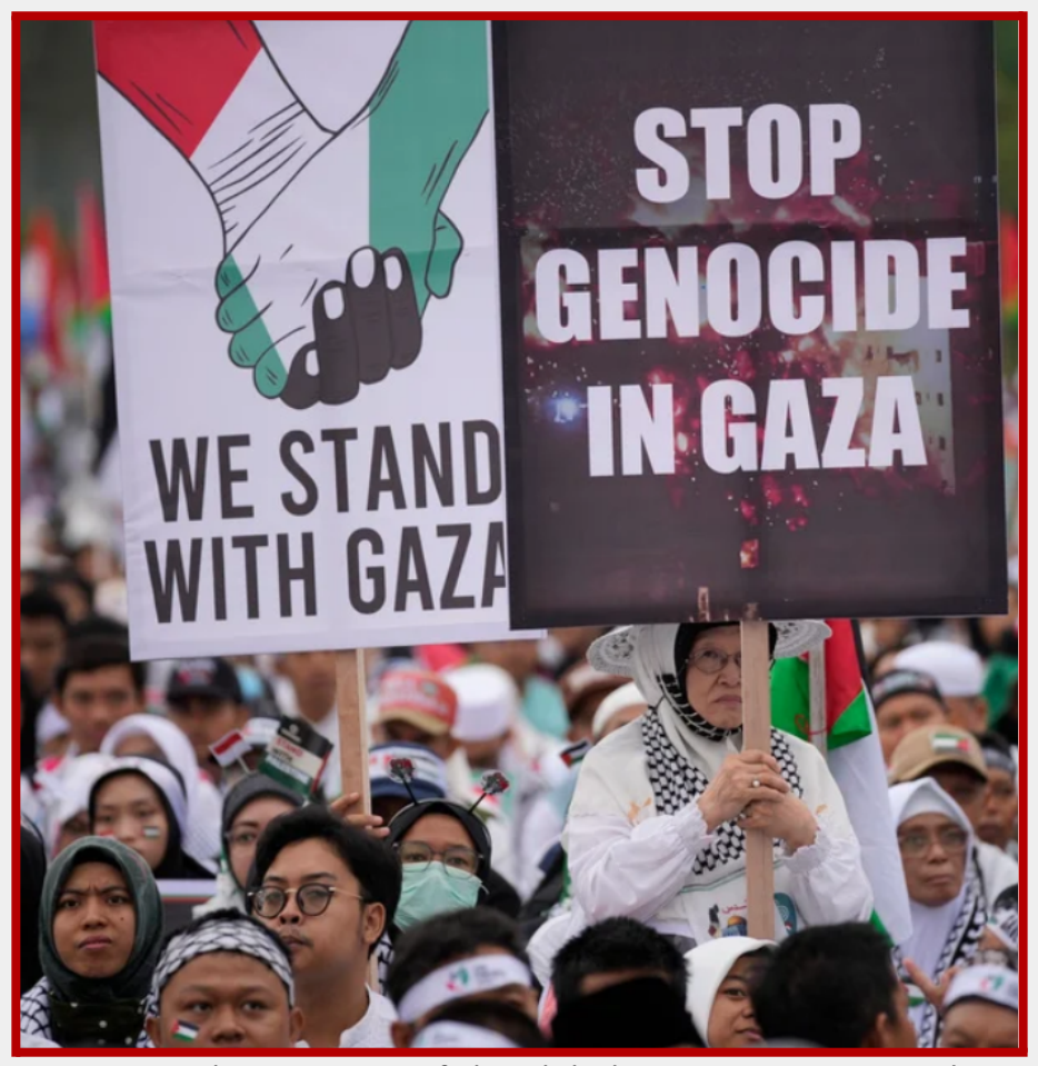
Protest in Indonesia, part of the global movement against the genocide in Gaza. <u>Source.</u>

The alternative insurance providers available in the UK which seem not to conduct business with the featured defence companies are Ecclesiastical and Covea. The list of better insurance companies will be kept under review and updated on our website. We expect more ethical insurance options to emerge as pressure builds. You can find details of how to switch your organisation's insurance to those providers on our website.