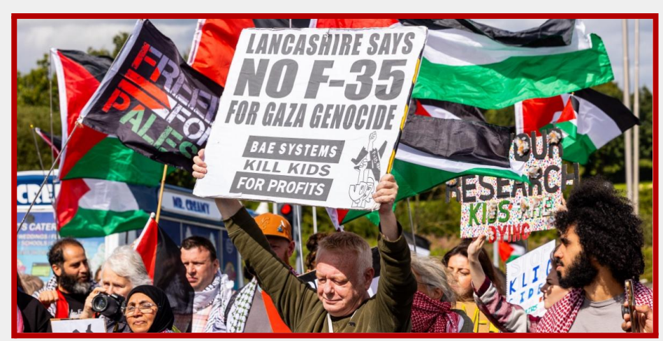
500 protestors blockading a BAE Systems factory in Samlesbury, Lancashire, August 25 2024.

orthopaedic surgeon, showing how UK-produced weapons are being used to target UK civilians [35].