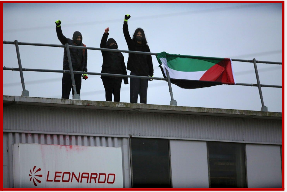
Palestine Action Occupy Roof of Leonardo Arms Factory in Southampton, October 15 2023.

Leonardo manufactures naval gun systems installed on Israel's Sa'ar-class warships. These warships form the backbone of Israel's navy and are key to enforcing the naval blockade of Gaza [43]. In October 2023, Sa'ar 6 warships, equipped with Leonardo's weaponry, carried out their first operational assault on Gaza [44].