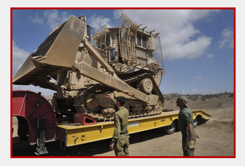
Israeli military Engineering Corps troops moving an Israeli military Caterpillar D-9 armored bulldozer, in the northern Golan Heights, September 19, 2024.

The D9 has also been linked to atrocities such as burying the bodies of Palestinians killed during operations [58]. Beyond its military functions, the D9's use in destroying infrastructure critical to civilian life, such as roads and water systems, reflects its role in systematic efforts to devastate Palestinian communities.