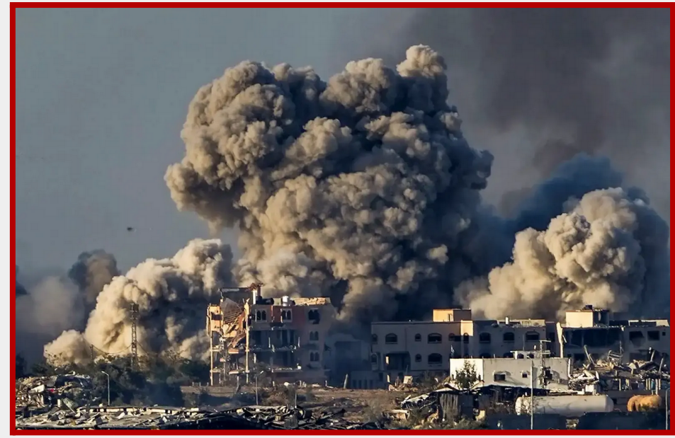
Much of Gaza has been destroyed following Israel's offensive in the enclave.

The largest companies on the list by revenue are: Boeing, Lockheed Martin and Caterpillar, with each one reaching a revenue between $78-67 billion. The smallest companies on the list are Elbit Systems and Leonardo, reaching revenues of $6-15 billion. The three biggest defence companies are underwritten by RSA, Chubb and Zurich.