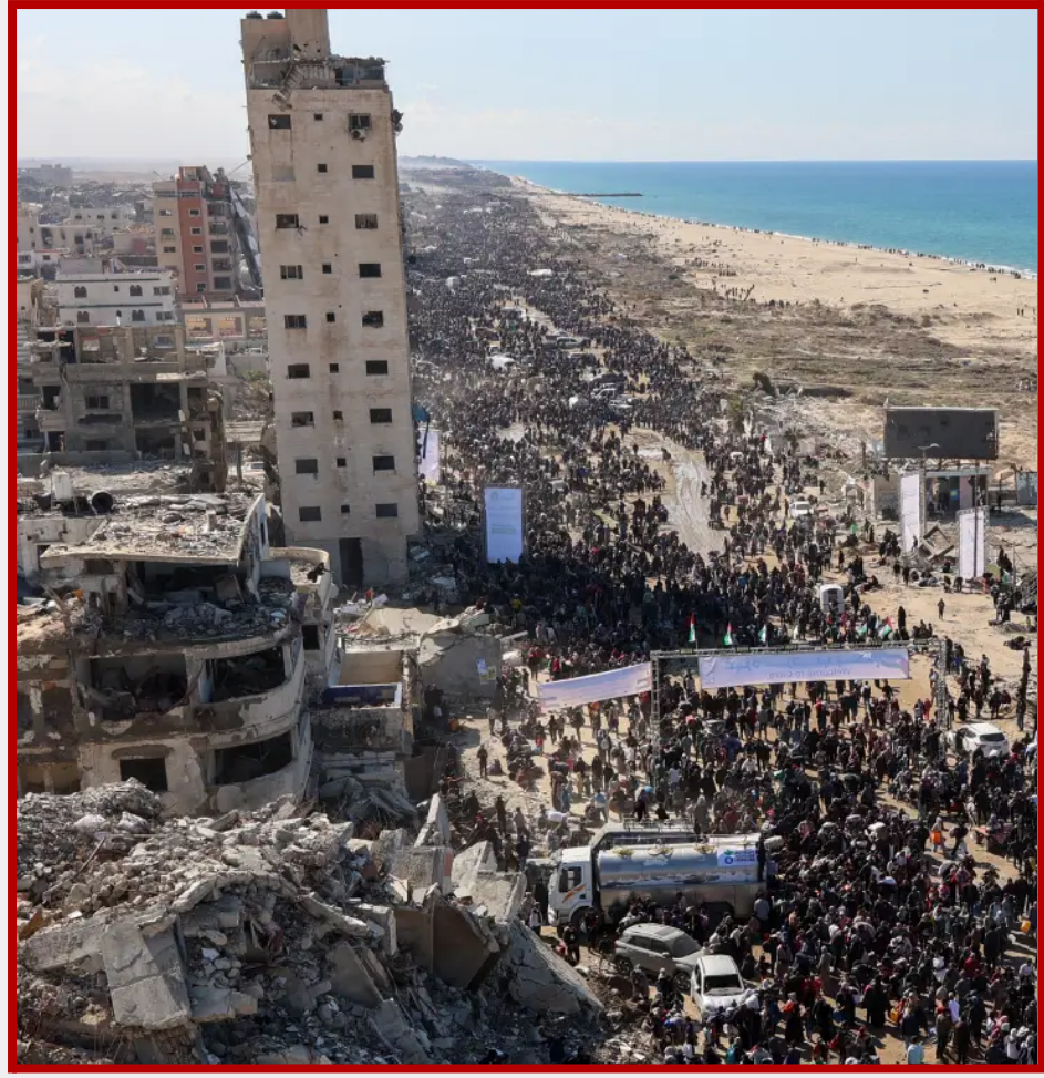
Thousands of displaced Palestinians are returning to the North of war-ravaged Gaza. Source.

This report analyses the investments of Intact Financial Corporation rather than RSA, as RSA Insurance Group - being a fully owned subsidiary of Intact [23] - does not disclose its direct investments separately due to their size. As a result, RSA's investments are integrated into Intact's overall portfolio, which is the focus of this analysis.