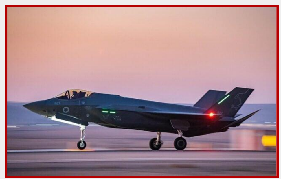
Israeli F-35 fighter jets return to the Nevatim Airbase in the occupied Naqab (Negev) desert after carrying out an airstrike in Yemen, July 20, 2024.

Stavros Atlamazoglou from The National Interest: "In many ways, the F-35 Lightning II is the combat quarterback of the skies. [...] It can] coordinate different assets in a more effective kill chain." [52].