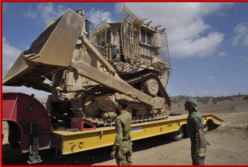
Israeli military Engineering Corps troops moving an Israeli military Caterpillar D-9 armored bulldozer, in the northern Golan Heights, September 19, 2024.

The D9 has also been linked to atrocities such as burying the bodies of Palestinians killed during operations [58]. Beyond its military functions, the D9's use in destroying infrastructure critical to civilian life, such as roads and water systems, reflects its role in systematic efforts to devastate Palestinian communities.