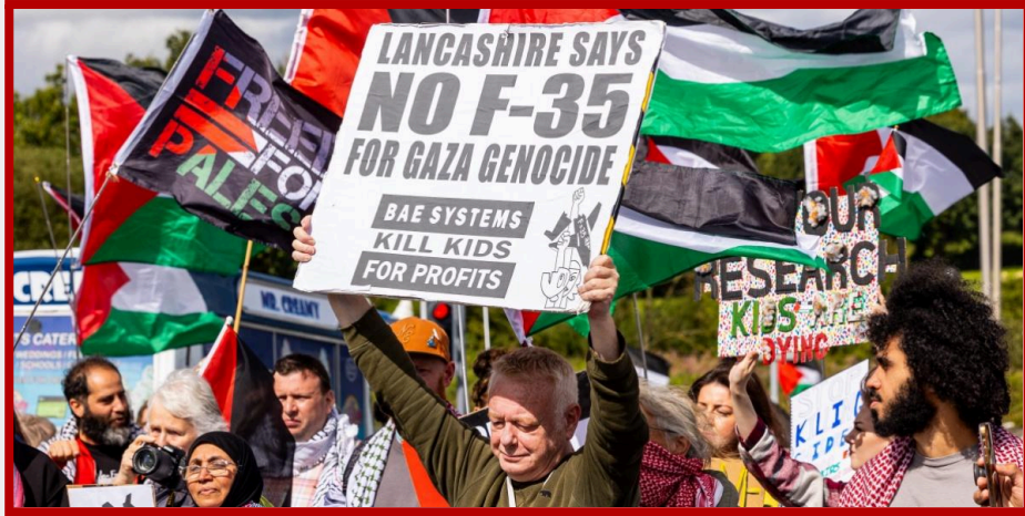
500 protestors blockading a BAE Systems factory in Sarnesbury, Lancashire, August 25 2024.

orthopaedic surgeon, showing how UK-produced weapons are being used to target UK civilians [35].