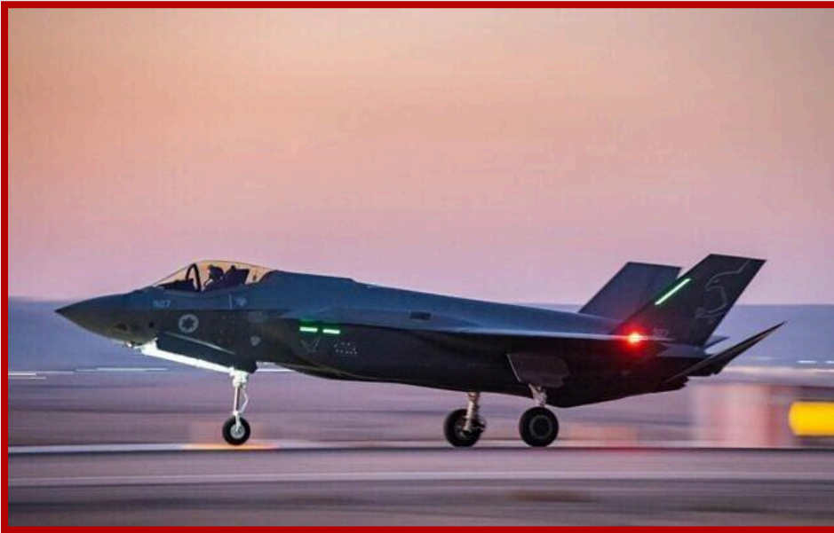
Israeli F-35 fighter jets return to the Nevatim Airbase in the occupied Naqab (Negev) desert after carrying out an airstrike in Yemen, July 20, 2024.

Stavros Atlamazoglou from The National Interest: “In many ways, the F-35 Lightning II is the combat quarterback of the skies. [...] It can] coordinate different assets in a more effective kill chain.”[52].