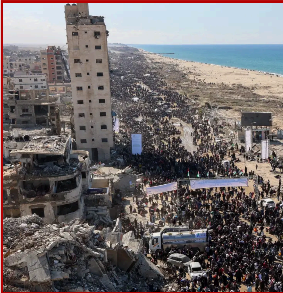
Thousands of displaced Palestinians are returning to the North of war-ravaged Gaza. Source.

This report analyses the investments of Intact Financial Corporation rather than RSA, as RSA Insurance Group - being a fully owned subsidiary of Intact [23] - does not disclose its direct investments separately due to their size. As a result, RSA's investments are integrated into Intact's overall portfolio, which is the focus of this analysis.