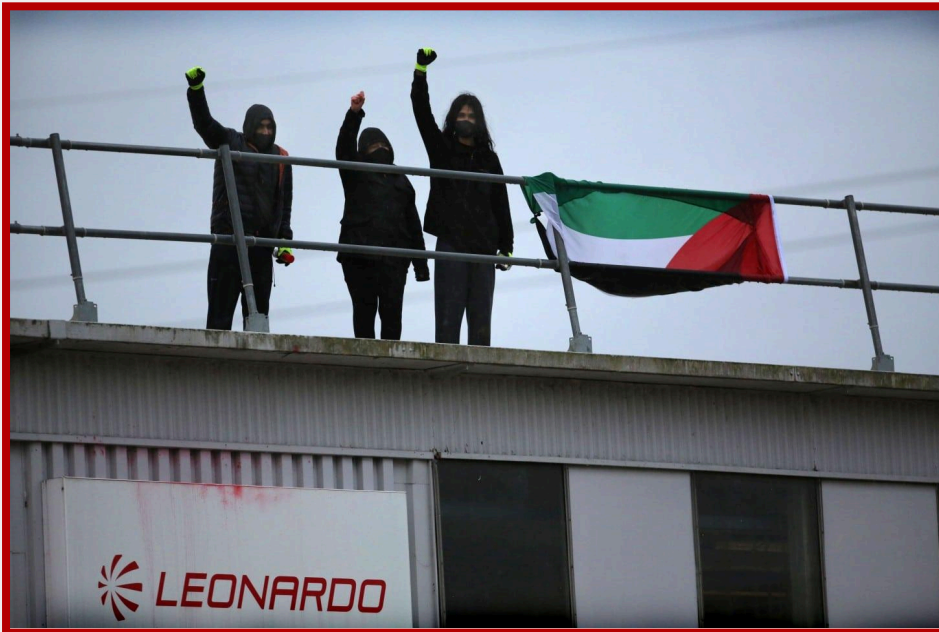
Palastine Action Occupy Roof of Leonardo Arms Factory in Southampton, October 15 2023.

Leonardo manufactures naval gun systems installed on Israel's Sa'ar-class warships. These warships form the backbone of Israel's navy and are key to enforcing the naval blockade of Gaza [43]. In October 2023, Sa'ar 6 warships, equipped with Leonardo's weaponry, carried out their first operational assault on Gaza [44].