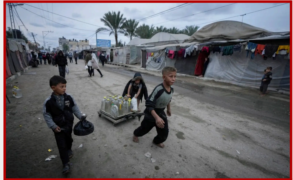
Palestinian children move a cart carrying plastic bottles of water at a camp for displaced people in Deir al-Balah, Gaza Strip.

When it comes to investing in defence companies, Aviva is by far the largest investor with $880 million invested across 12 defence contractors. Allianz comes second with $452 million invested across 15 complicit defence companies. Allianz is the only one still investing in Elbit Systems. Our analysis of insurers' investments over the whole of 2024 reveals that three out of five examined insurers kept increasing their investments in companies supplying military equipment to Israel throughout the year, giving no consideration to the unfolding genocide and making bigger financial gains driven by the mass murder of innocent civilians.