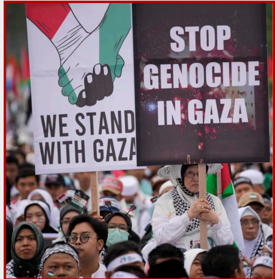
Protest in Indonesia, part of the global movement against the genocide in Gaza. Source.

The alternative insurance providers available in the UK which seem not to conduct business with the featured defence companies are Ecclesiastical and Covea. The list of better insurance companies will be kept under review and updated on our website . We expect more ethical insurance options to emerge as pressure builds. You can find details of how to switch your organisation's insurance to those providers on our website .