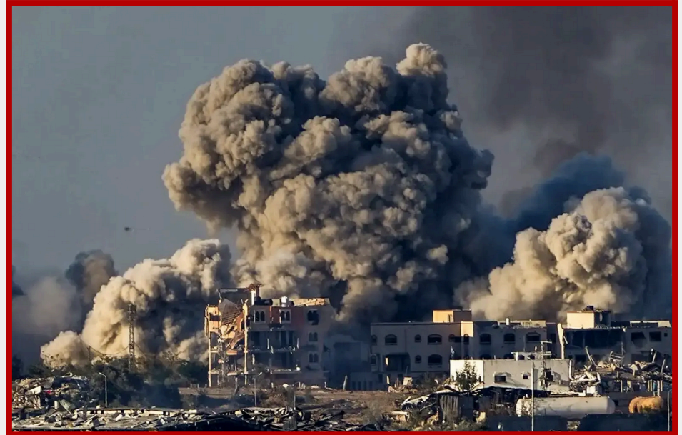
Much of Gaza has been destroyed following Israel's offensive in the enclave. Source.

The largest companies on the list by revenue are: Boeing, Lockheed Martin and Caterpillar, with each one reaching a revenue between $78-67 billion. The smallest companies on the list are Elbit Systems and Leonardo, reaching revenues of $6-15 billion. The three biggest defence companies are underwritten by RSA, Chubb and Zurich.